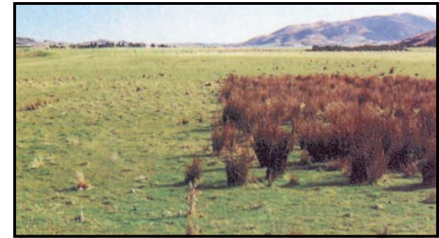
Before and after photo showing Rotowiper results

This means you are only applying the herbicide to the most effective kill area of the plant.