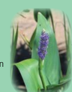
Joseph M. DiTomaso

Heart-shaped leaves surround dramatic flower spikes. Excellent filtration ability. Place in containers in 1 foot of water. 3 to 4 feet tall, 2 to 2½ feet wide.