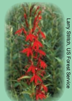
Larry Smith, US Forest Service

A spectacular blooming bog plant. Tubular flowers resemble honeysuckle or salvia and attract hummingbirds. L. cardinalis and L. fulgens to 6 feet with red flowers; L. siphilica 2 to 3 feet with blue flowers.